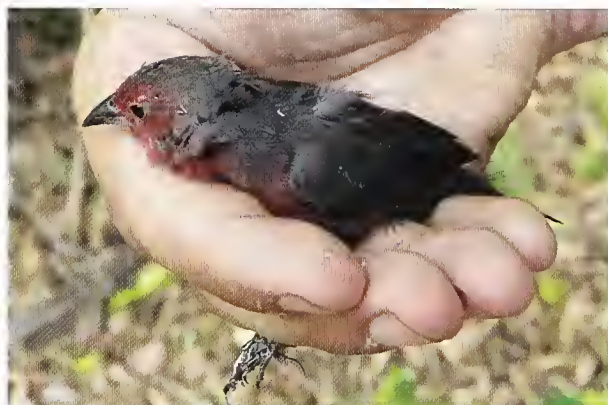
Figure 6. Male Kulikoro (Mali) Firefinch / Amarante du Mali Lagonosticta virata , Dindéfello Nature Reserve, Senegal, April 2011

A female with Red-billed Firefinches Lagonosticta senegala on 16 April. Apparently only two previous records for Senegal, both from the extreme south-east, at Dindéfello and nearby Ségou (Morel & Morel 1990), at the north-westernmost edge of the species' range.